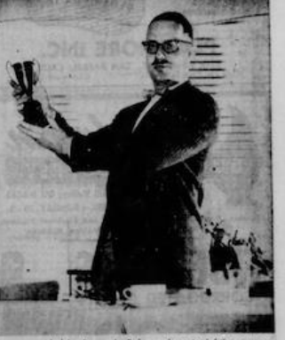
was provided by Bermuda Palms, where tonight's convention delegates will dine and conduct the evening portion of their gathering. This will include announcement of speech contest awards. Marin's three Toastmaster clubs are conclave hosts.