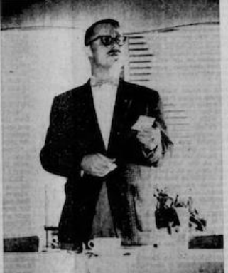
paper he refers to. Audience members feel he is speaking directly to them, which he is. This, by the way, is the cover photo, too.