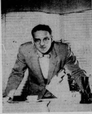
No. 800. The over-casual, foot-on-the-chair, cigarette-in-hand approach, the speaker so weighted by his words he