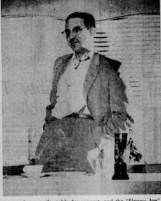
must lean on the table for support, and the "Sloppy Joe" locker-room look are all illustrated here by Hellman.